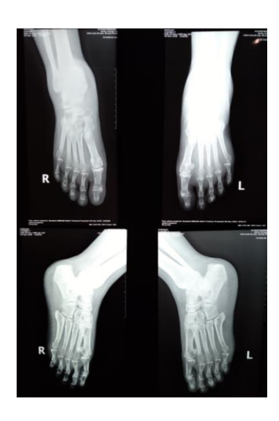
Picture 2. x-ray of pedis described bilateral multiple porotic lesion in multiple bones starting from calcaneus, talus, and cuneiform.

She diagnosed as having ANA-negative SLE on the basis of malar rash, polyarthritis, painless oral ulcers, subcutaneous nodules, fever, and hair fall. The patient gets methylprednisolone and most of her symptoms were controlled.