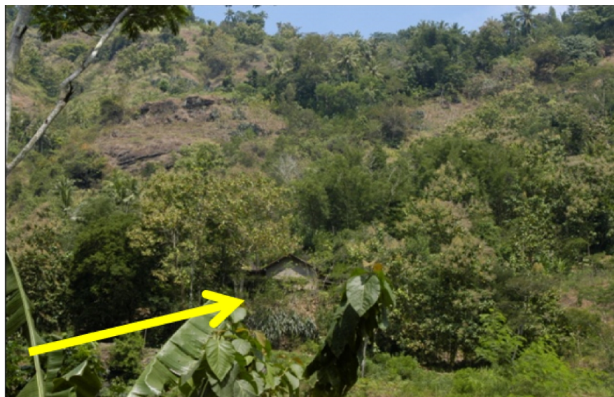
Figure 2. Houses Position in Landslide Area

In research area, rainfall happened in a high intensity that was 2887 mm/year (type B according to Schmidt Ferguson) with the rainy days were 105 days/year