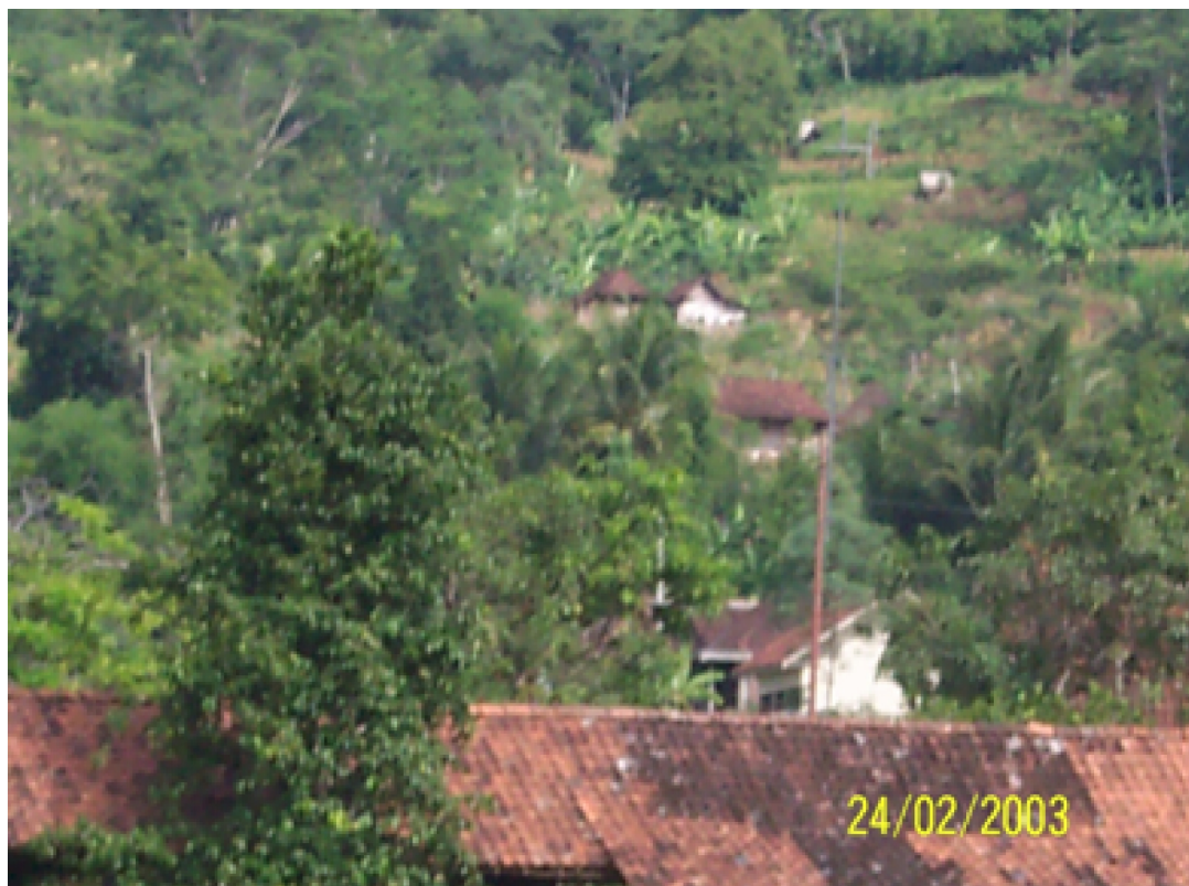
Figure 4. Residential condition before relocation

Chambers (1983) stated that poverty has influenced much to people in fulifilling their needs; both the need for safety and the need for food. The prohibition policy of planting annual crops on sloping lands was insufficiently responded properly. This was caused