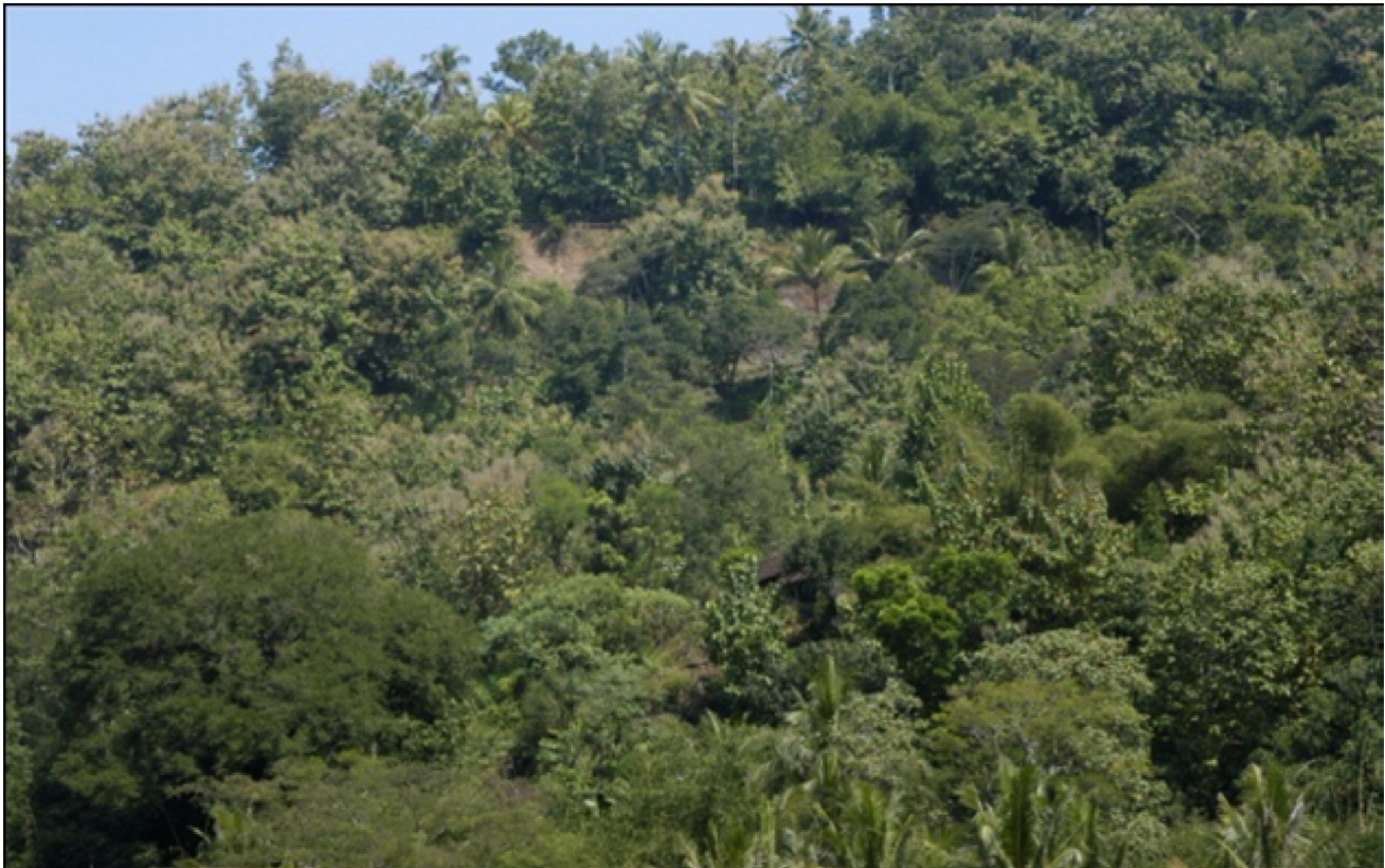
Figure 4. Land Cover of research Site

14% continued their study in a higher level whereas the rest (86%) of people only had elementary level of education.