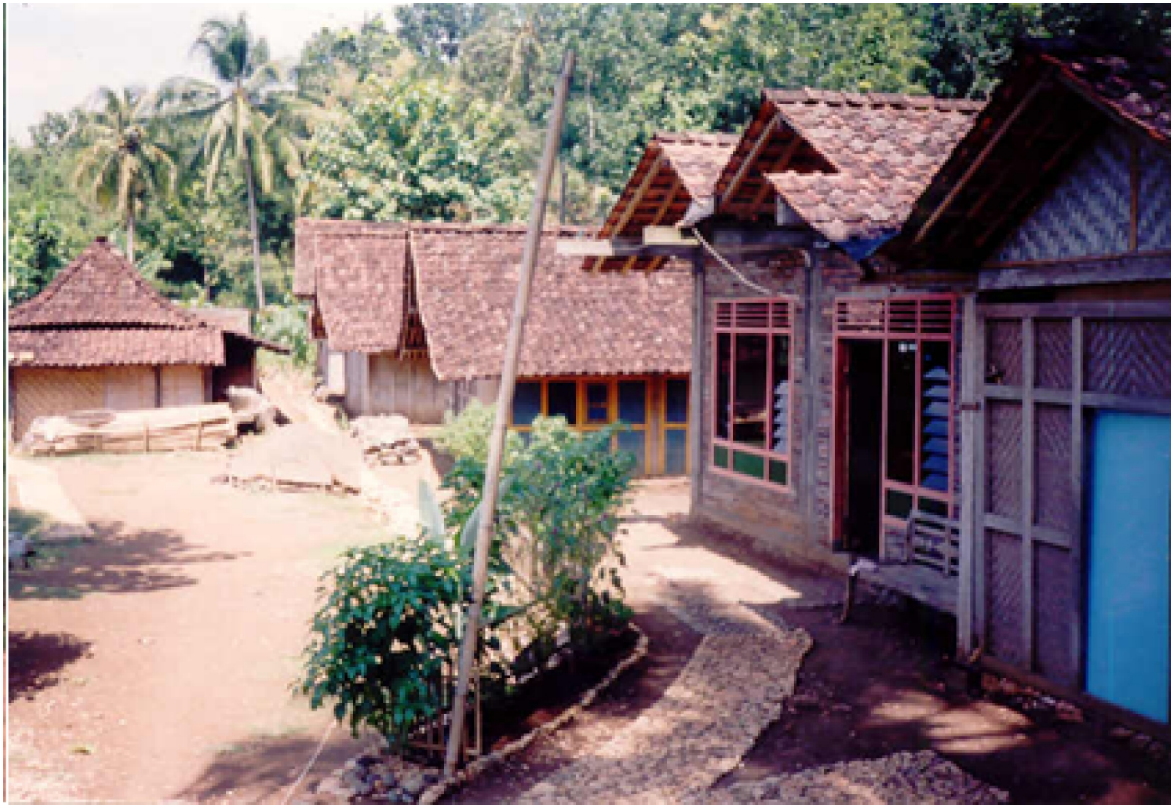
Figure 5. pattern after relocation

by the insistence of community basic-needs to the land for their livelihood. The phenomenon happened as well in 1998 when there was a 'reform movement'. There was an 'anomali' in people circumstance that they could do anything that they want. People did not have any fear on anything including sacred places or sacred jungle. It showed that in any hard circumstance, people could do anything including breaking social values. In his research Sartohadi (2008) stated that to respond to and to cope with the landslide caused by human activities, people should be empowered.