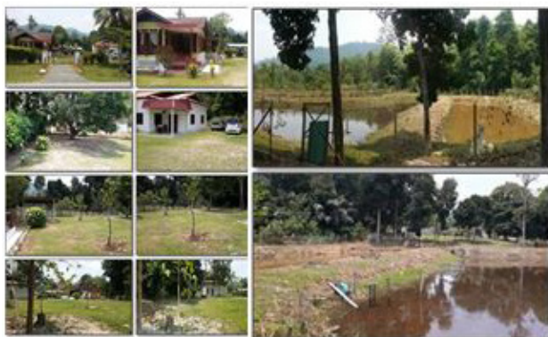
Figure 1. Site Condition which Surrounded by Elements of Nature

The chosen study context was located in the rural area in Laman Tamara, Kuala Pilah, Negeri Sembilan, Malaysia, due to a natural characteristic. The land is located in the rural area, of which its greenery and close-knit community typify the Malay rural landscape. Laman Tamara has its courtyard with an enormous open space in front and back with the scale of the greenery that can access to the natural material (refer Figure 1).