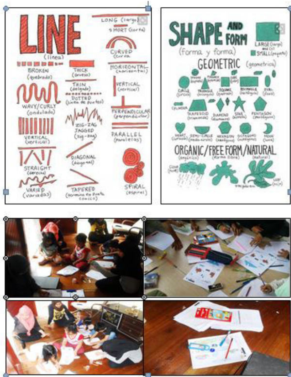
Figure 2. Drawing Activity by the Children