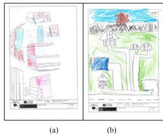
Figure 4. (a) A 7-year girl and (b) a 9-year boy drawings showing the use of form and shapes that gave more comprehensives the elements of design.

The other drawing from a boy aged 9 (Figure 4 (b)) shows that he identified and manipulable shapes into a house plan. In the drawing, he allocates for open space. He described his drawing as walking in the botanic park. The boy also drew few houses in a mushroom shape, and other houses were the typical shapes. For fishing activity, can be seen at the back of the house.