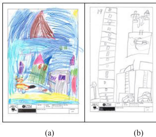
Figure 3. (a) A 6-year girl stated that she designed the house with varieties of colors, and she imagined

Analysis of children’s drawings indicated that the 6-year children showed a great interest to draw more on square shapes. These were referring to 2D illustration as it has more converging lines which usually lead to ‘vanishing point.’ For example, an image of a house, swimming pool, cars, greenhouse (Figure 3 (a) and (b)).