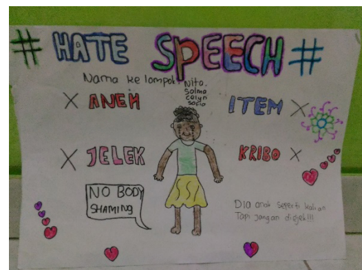
Figure 3. Students' poster on Hate Speech topic