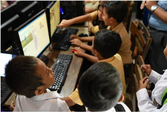
Figure 1. ILP class at SD Jetis 2 Yogyakarta

On the other hand, the facilitators require additional tools for the teaching learning process in schools that have not provided the computers yet. Hence, the students are encouraged to employ their personal computers or smartphones in the classroom under the facilitators' supervision. The teaching itself mostly utilizes appliances supplied by the schools, such as a projector, an LCD, speakers, a whiteboard, and markers. In addition, the facilitators prepare a mobile internet connection whenever they require it for the classroom activities. This implementation of technology could help enhance the teaching learning experiences as it creates a more attractive, innovative, and creative atmosphere (Grajcevcic and Shala, 2016). However, the facilitators' supervision is necessary to make it more managed.