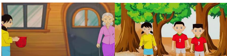
Figure 2. Slide Animation of Prigen Legend

The results of the portfolio test above have received results from the continuation the legend of Prigen's reconstruction to improve spiritual intelligence. So that the reconstruction of a text becomes a video. Formerly a legend was only oral to oral, now it can be enjoyed in the form of animated videos.