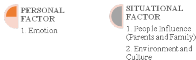
Figure 2. Supported Factors Which Influence Teenagers' Respectful Attitude toward The Elderly.