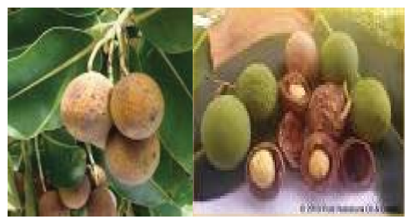
Fig. 1 Nyamplung Seeds